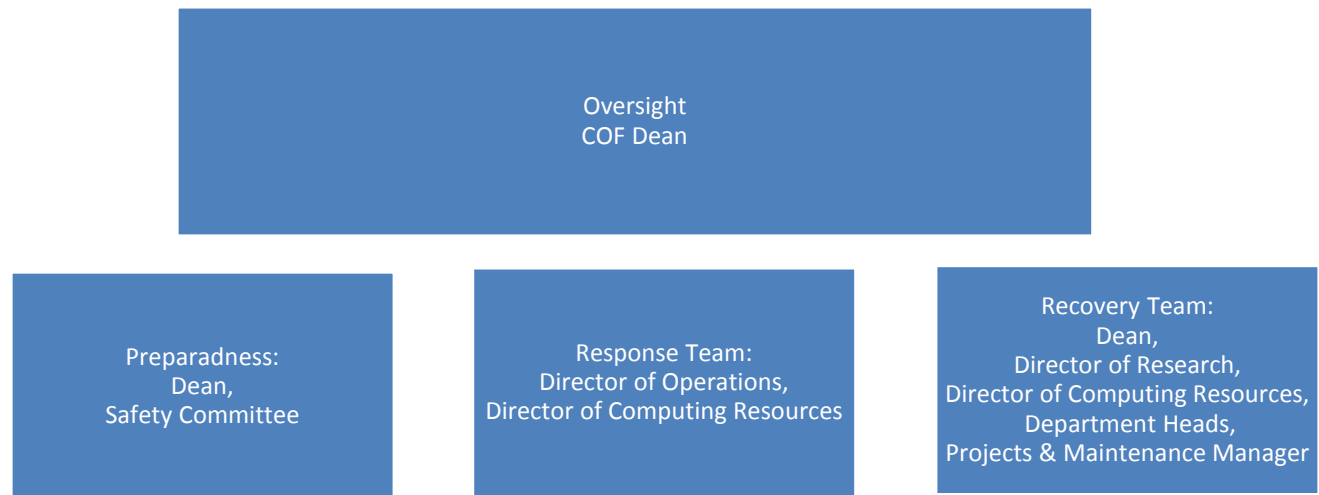
Figure 1 Organization